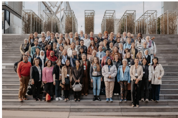
Members of the ISSN Network at the ISSN Directors' Meeting, October 2025